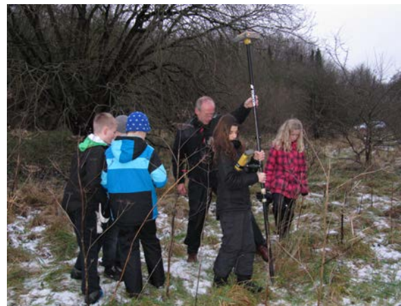
Fig. 2. Example activity