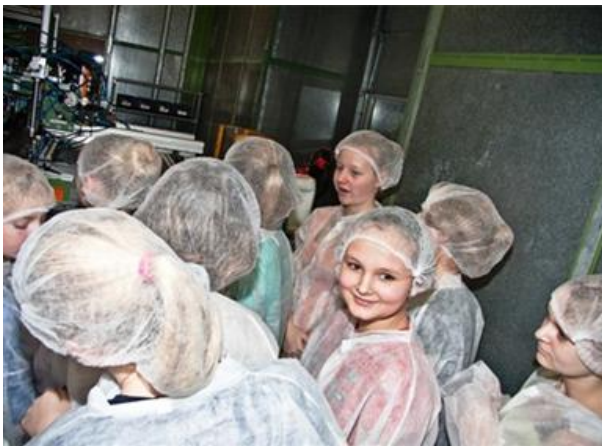
Fig. 1. Example activity

The purpose of the project was, according to the project description, to strengthen the interest of primary and secondary students in the areas of science, technical education, and engineering. This was attempted via combining the teaching in the schools with teaching in a company and/or another educational institution. Thus, it also intended to increase student knowledge regarding possible job opportunities (projektsampil.dk). The project established 16 collaboration cases between educational institutions and businesses. In eight cases, the collaboration was between either a primary school class or a high school class and a company, while another eight cases involved collaboration among all three levels: primary schools, high schools, and a company. Figures 1 and 2 show two examples of teaching courses. The one is a collaboration between primary school and a metal processing company (6. graders in mathematics), and the other one is a collaboration between primary school, VIA UC and a building surveyors company (5.-8. graders geography). The educational processes that were developed are documented in education schemata, videos, teacher instructions, and educational material developed for other teachers who want to implement similar activities.