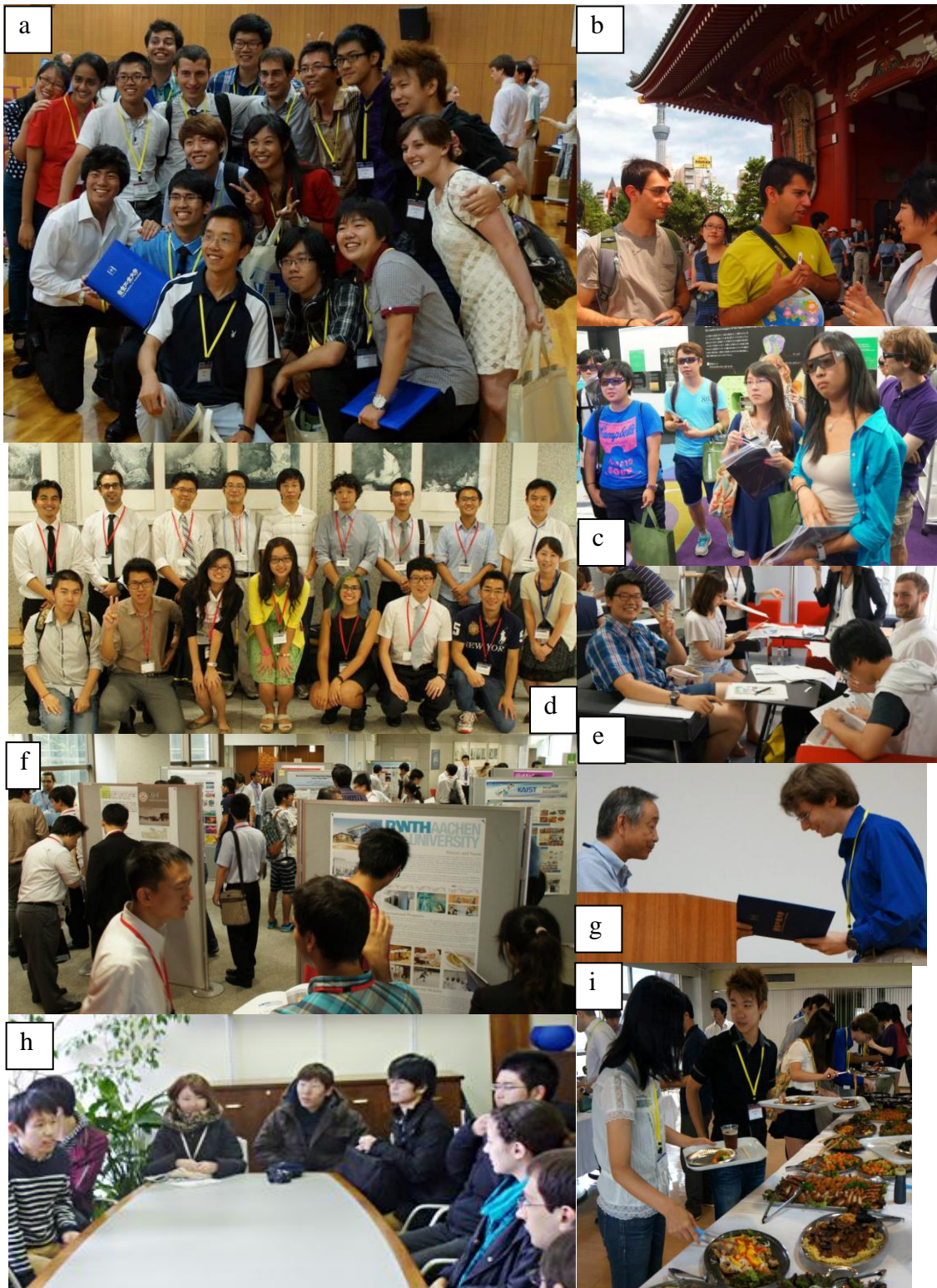
Fig. 1 a)2013 TiROP summer students, b)visit to a Shrine in Asakusa, Tokyo, c)lab tour at Riken, d)AOTULE 2013 summer students, e) discussions at international communication space, f)workshop poster session g) participation certificate conferment h)Tokyo Tech students visit Brown Univ. in March 2014 and meet 2013 TiROP summer participants (far right), i) TiROP closing ceremony luncheon.