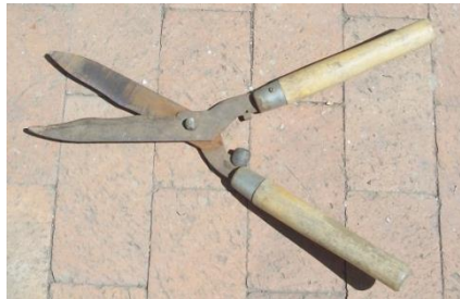
Fig.1. The pruning shear manufactured group I after testing.

Students' response to the question " why is failure analysis important to your training as an engineer? " established they developed skills in formulating an engineering problem. Student G's response from group IV that " investigating component failure is important because experience need to be gained from studying which factors (either wrong material selection, poor design criteria, or poor manufacturing practice) resulted in a damaged part so that re-occurrence could be avoided in future in order to save financial resources to be used for re-manufacturing " affirmed this assertion. Another student H from the same group also mentioned of " the need to save lives as inappropriate design and poor material selection could cause destruction of lives and properties as evident through the recurring incident of collapsed buildings in various parts of Nigeria as at 2010. "