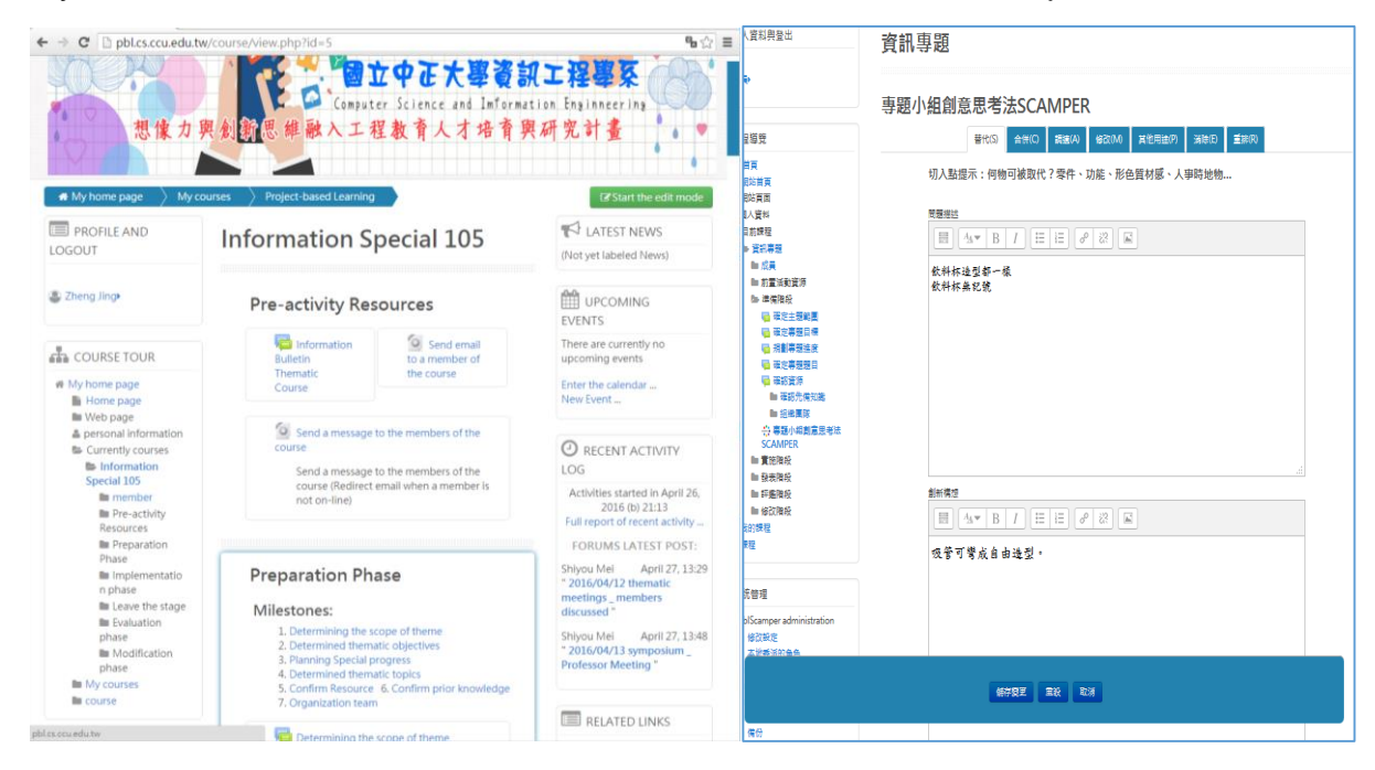
Fig. 2. PBL learning platform

In the presentation stage, each team needs to turn in a written report (include design, development, test cases, user manual, etc.) and make a public presentation. An exhibition of the results of Capstone projects was held to the public. At the same time, to evaluate the proficiency and creativity of each project, two experts from Computer Science field, three experts from creativity assessment field were invited to evaluate the technology readiness and creativity, respectively. During the evaluation stage, the platform also provides an activity for peer assessment within a group as well as cross groups. Finally, in the revision stage, the platform provides activities for each team to turn in its revised final report based the comments from evaluators and advisors. Each team also needs to turn in a review report in which each team addresses the problems they faced, what have been solved, and what needs to be further improved in the future.