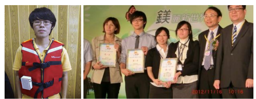
Fig. 6 A team of Tatung University won the first prize of The Awards for Innovative Design and Application of Light Metal held by the Ministry of Economic Affairs of Taiwan in 2012.