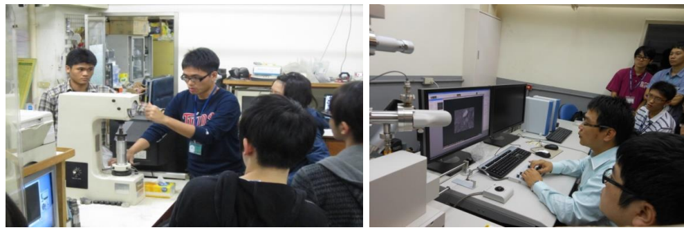
Fig. 2 The specific experimental procedures for carrying out the tests and analysis of materials is introduced. This includes mechanical properties tests, SEM, XRD, DTA, FTIR, Raman, etc.

The specific experimental procedures for carrying out the tests and analysis of materials are introduced. (as seen in Fig. 2) The basic objective of these supplemental experiments is to give students the tool selection and hands-on experience in the third year.