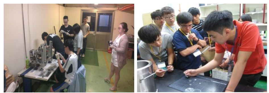
Fig. 3 Students did the laboratory exercises under a design-based course module in the manufacturing-based Maker Space.

This course is basically to help the students to finish a proposal for studying or applying the smart materials. Students are divided into several small groups and trained by different field of materials technology. A device or a material system and the functional properties will be selected as the object for the study and design. More importantly, emphasis is given for improving students' learning skills and creative thinking by having small group discussions and frequent quizzes on laboratory exercises. A design-based course module is applied in this course and conducted in the manufacturing-based Maker Space. (as seen in Fig. 3)